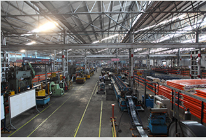
State-of-the-art, high-capacity automated manufacturing facility