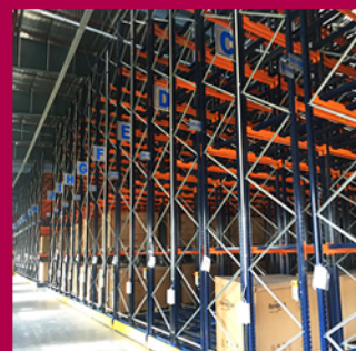
Mobile Pallet System