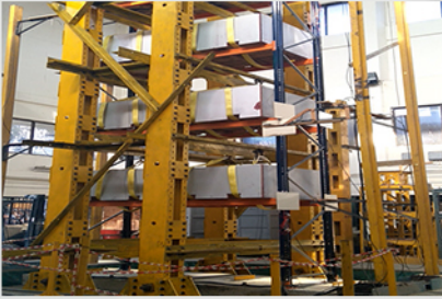
Tested seismic racking