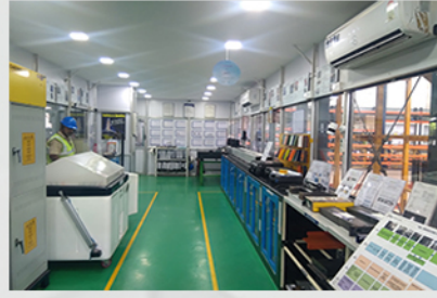
Comprehensive in-house testing facility for assured quality