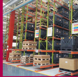
Very Narrow Aisle Racking