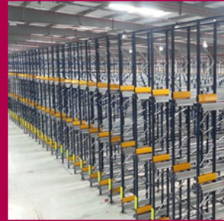
Shuttle Pallet System