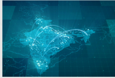
13 branches & 75+ channel partners serving all locations across the country