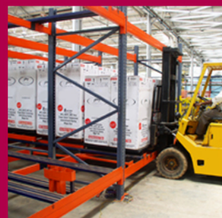
Push Back Racking